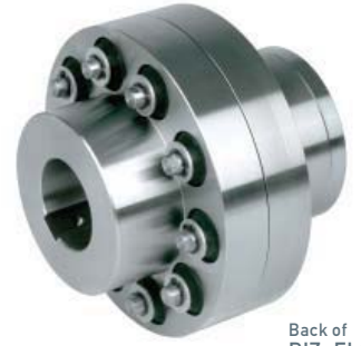
Back of RIZ..ELG2